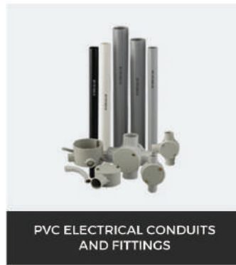
PVC ELECTRICAL CONDUITS AND FITTINGS