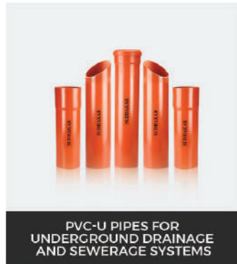
PVC-U PIPES FOR UNDERGROUND DRAINAGE AND SEWERAGE SYSTEMS