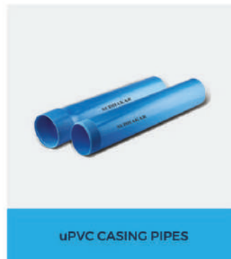
uPVC CASING PIPES