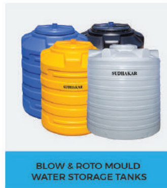
BLOW & ROTO MOULD WATER STORAGE TANKS