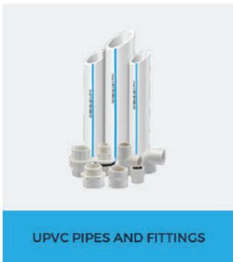
UPVC PIPES AND FITTINGS