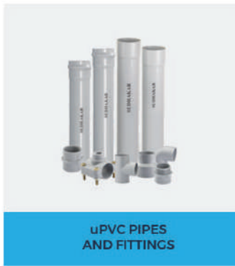
uPVC PIPES AND FITTINGS