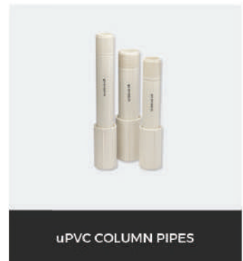
uPVC COLUMN PIPES