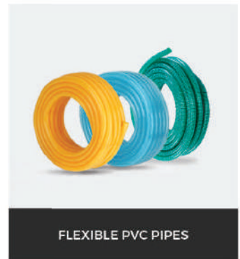
FLEXIBLE PVC PIPES