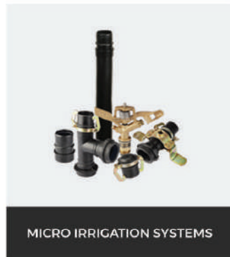
MICRO IRRIGATION SYSTEMS