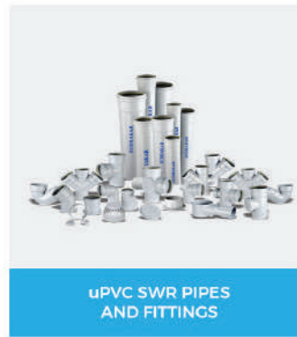
uPVC SWR PIPES AND FITTINGS